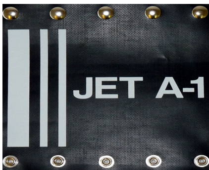
Hose cover, 1.1/2 inch JET A-1 Part Number: 5100000010

It has been accepted for some years that improvements needed to be made in order to reduce the number of incidents involving refuelling light aircraft with the incorrect fuel grade. Selective filler points/ nozzle spouts and wing marking stickers have been introduced along with a number other measures, but as an additional reminder for the operator we have developed our Grade Identification Sleeves. They are screen printed with the relevant fuel grade identification on coloured vinyl and are secured onto the refuelling hose immediately upstream of the trigger nozzle.