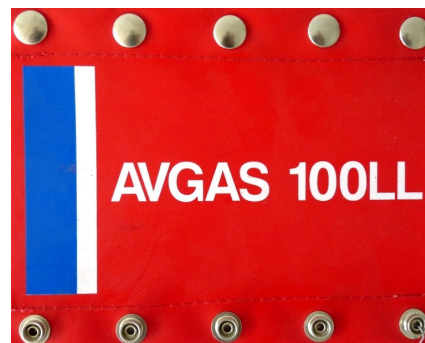
Hose cover, 1 inch AVGAS 100LL Part Number: 5100000005