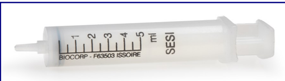
5 ml Nylon Syringe Part Number: 0902000120