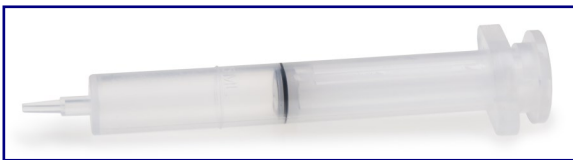
5 ml Nylon Syringe, reverse action Part Number: 0902000127

In order to perform the Water Detection test we offer a series of re-useable 5ml syringes. Low cost medical specification syringes should not be used for the test because they often have the incorrect tip size which will not fit the water detector capsule, and they may have an extremely short service life. However, although each re-useable syringe can be used to execute a number of tests, it does have a finite service life which is very dependant on the type of syringe, exact fuel specification, ambient conditions, and operating practices, hence syringes should always be considered as a consumable item. In time the seals will swell up and the Nylon itself will expand and render the syringe unserviceable. An alternative syringe is available which is made from Polyethylene. It has no rubber seal and comes with a special metal tip which is less prone to wear than the Nylon syringe and under certain operating conditions offers a longer service life. We have also developed a reverse action syringe which gives a one handed operation. The plunger is pushed (not pulled) to draw the fuel sample and this is more convenient to use when the operator is wearing thick gloves while carrying out the test.