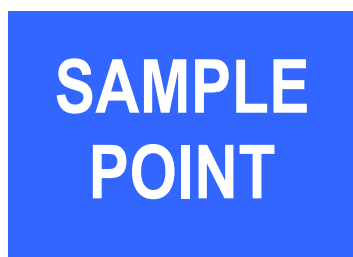
Sample Point 75 x 65 mm. Part Number: 0906000014.