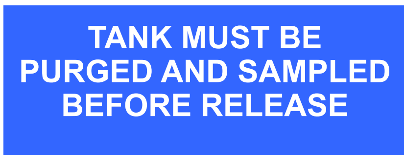
Tank Purge 300 x 100 mm. Part Number: 0906000013.