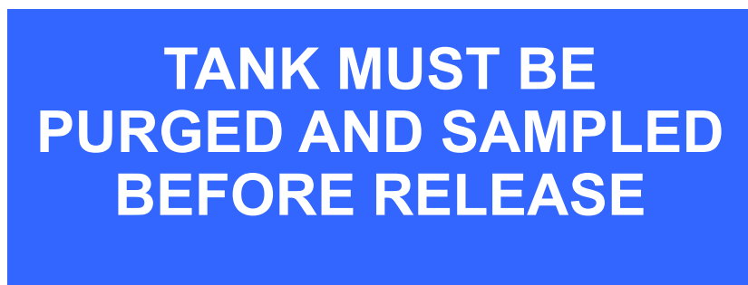
Tank Purge 300 x 100 mm. Part Number: 0906000013.