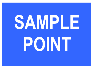
Sample Point 75 x 65 mm. Part Number: 0906000014.