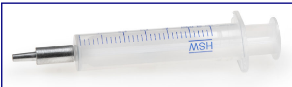
5 ml Polyethylene syringe with metal tip