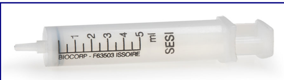
5 ml Nylon Syringe