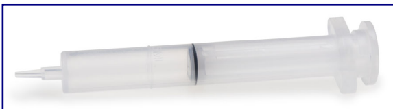
5 ml Nylon Syringe, reverse action

In order to perform the Water Detection test we offer a series of re-useable 5ml syringes. Low cost medical specification syringes should not be used for the test because they often have the incorrect tip size which will not fit the water detector capsule, and they may have an extremely short service life. However, although each re-useable syringe can be used to execute a number of tests, it does have a finite service life which is very dependant on the type of syringe, exact fuel specification, ambient conditions, and operating practices, hence syringes should always be considered as a consumable item. In time the seals will swell up and the Nylon itself will expand and render the syringe unserviceable. An alternative syringe is available which is made from Polyethylene. It has no rubber seal and comes with a special metal tip which is less prone to wear than the Nylon syringe and under certain operating conditions offers a longer service life. We have also developed a reverse action syringe which gives a one handed operation. The plunger is pushed (not pulled) to draw the fuel sample and this is more convenient to use when the operator is wearing thick gloves while carrying out the test.