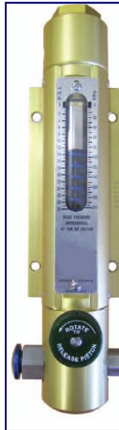
Gauge With Test Valve and Peak Hold