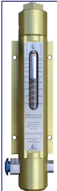
Gauge With Test Valve