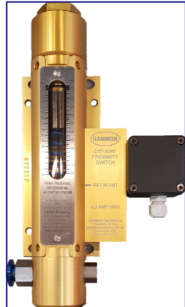
Gauge With Test Valve and DP Switch